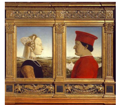
Curious connections between Music, Art and Gourmet!